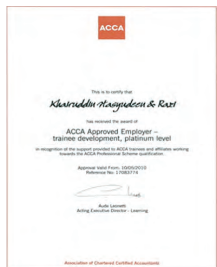
ACCA Approved Employer Trainee Development Platinum Level