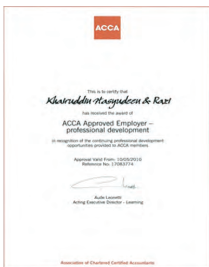
ACCA Approved Employer Professional Development