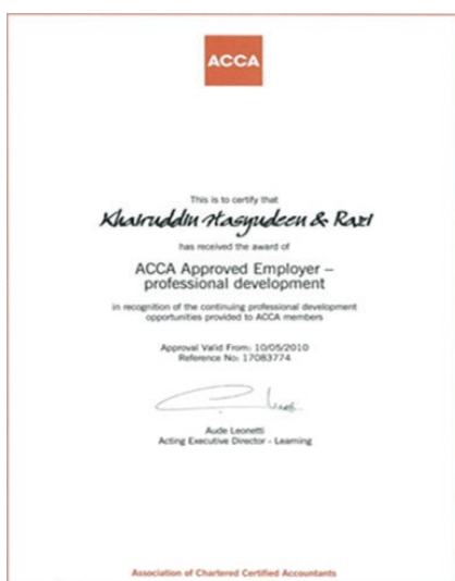
ACCA Approved Employer Professional Development