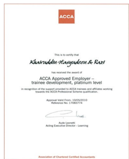
ACCA Approved Employer Trainee Development Platinum Level